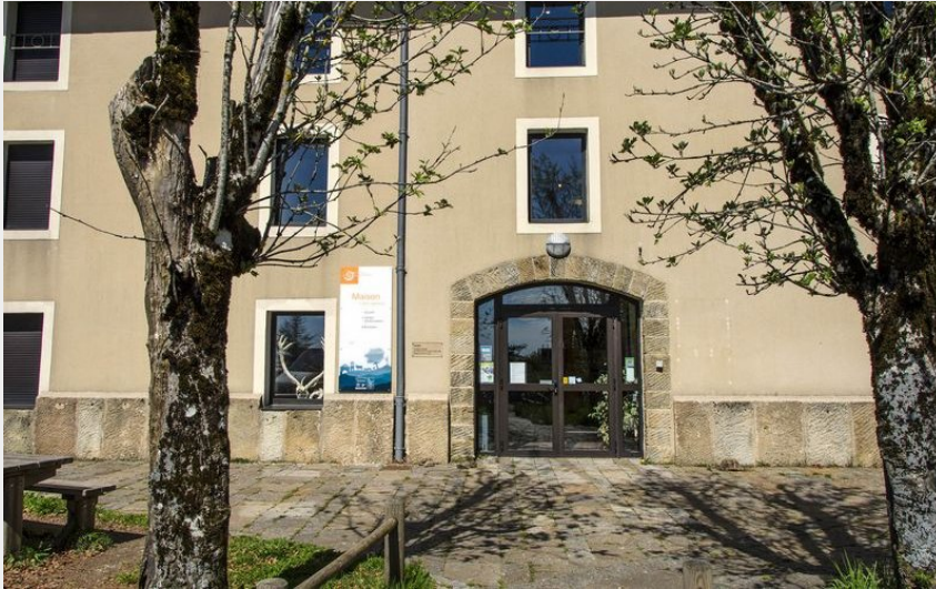
Attribution : Maison de l'Aigoual (© Olivier Prohin)