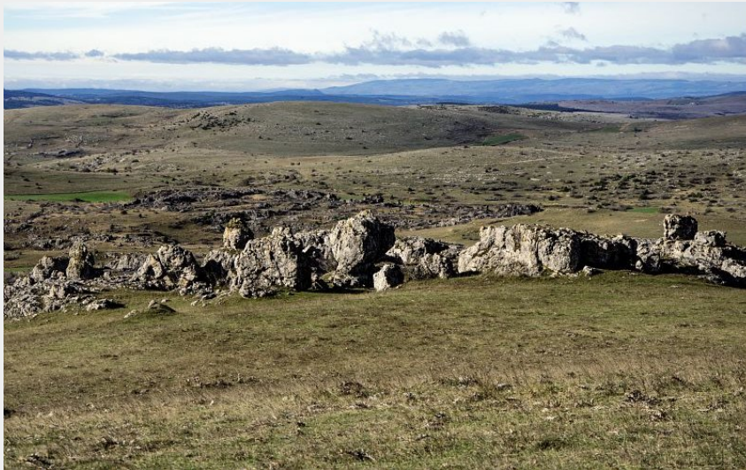
Paysage du causse Méjean à Galy