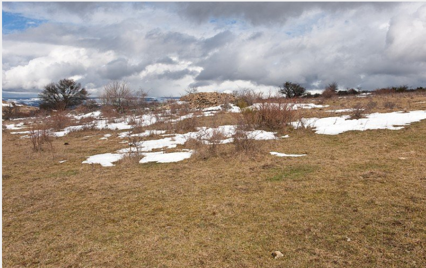
La Can de Ferrières