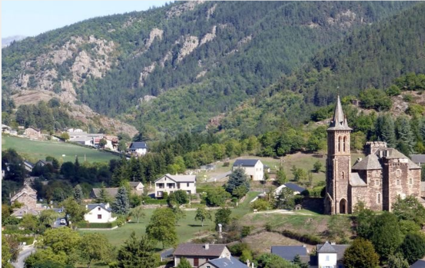
Vue sur Bédouès