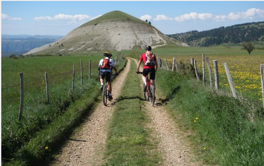
Les Puechs