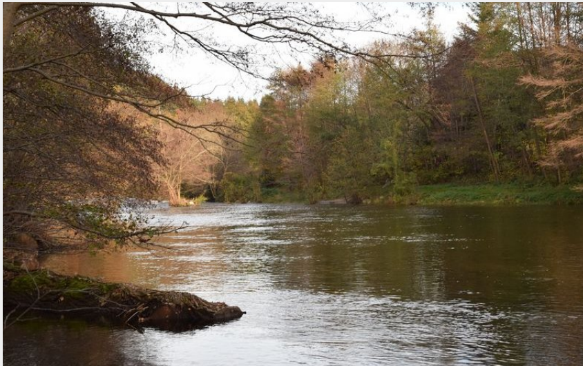
Le Tarn à Bédouès