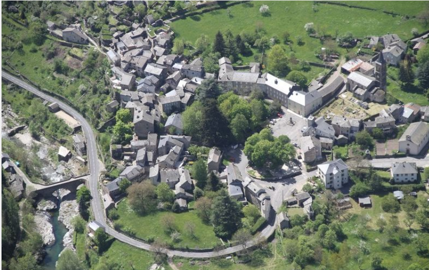
Vue aérienne de Vébron