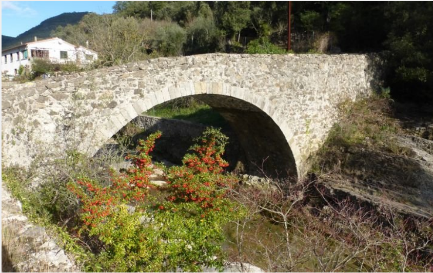
Valat de Roquefeuil (nathalie.thomas)