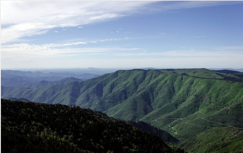
Vue de l'observatoire du Mont Aigoual