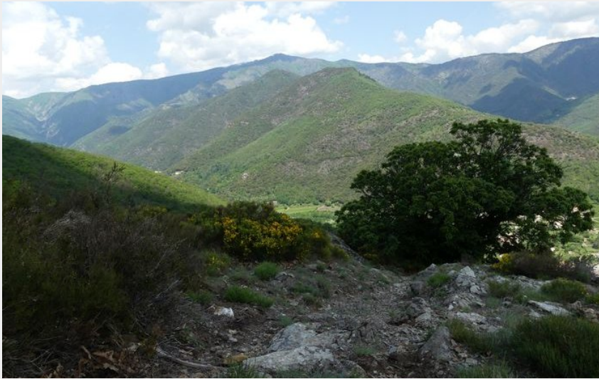
Vue sur l'Aigoual et ses contreforts (nathalie.thomas)