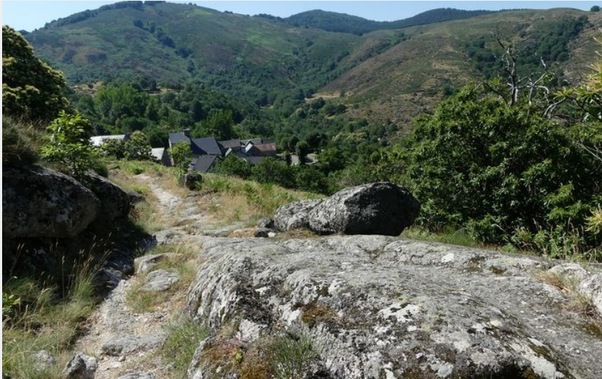
La Rouvière (nathalie.thomas)