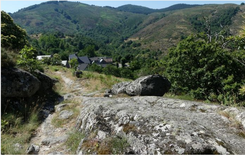
La Rouvière (nathalie.thomas)