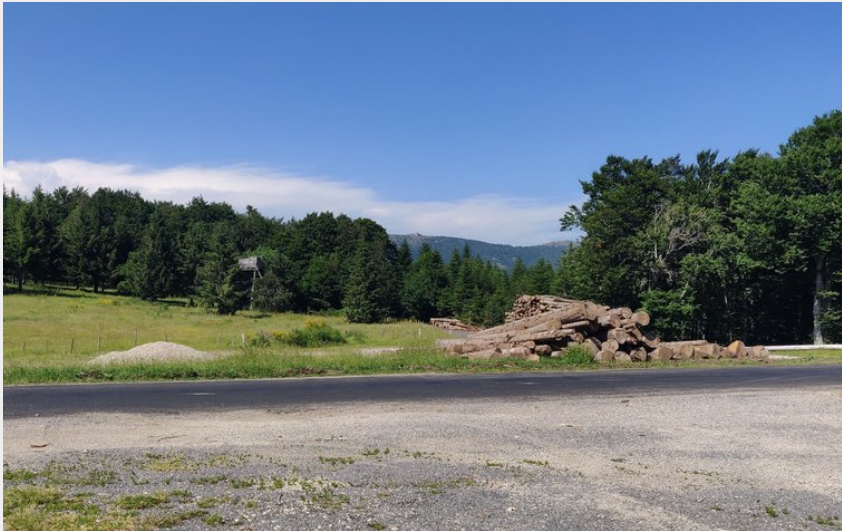
Une belle percée vers l'Aigoual et son observatoire (Béatrice Galzin)