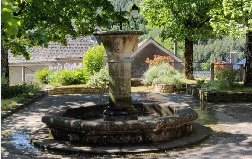
Fontaine des 3 ermites (Béatrice Galzin)