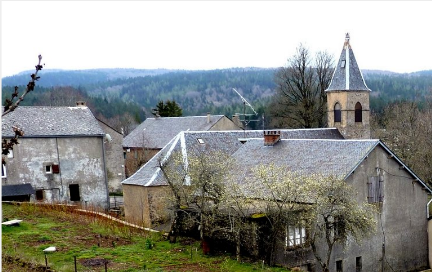
Village de Camprieu (Michel Monnot)