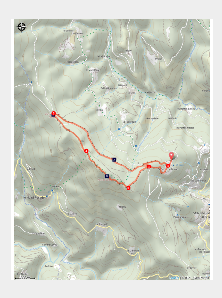
Rocs de Galta

On the former King's road between St-Germain-de-Calberte and Barre-des-Cévennes, you walk to the ridge of the Rocks of Galta for beautiful views onto the valley of St-Martin-de-Lansuscle and the Cévennes, from Mont Lozère to the summit of Mont Aigoual.