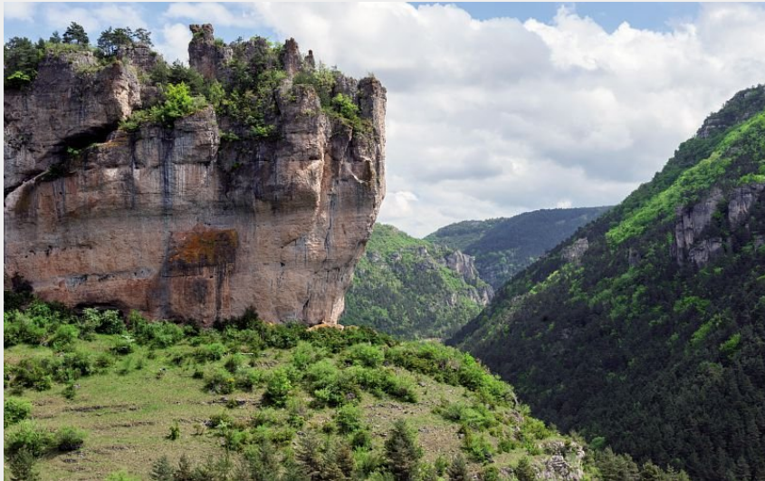
Roc de Saint-Gervais