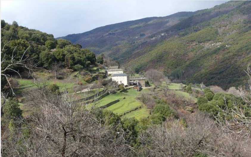
La Garnerie