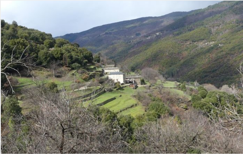
La Garnerie (nathalie.thomas)