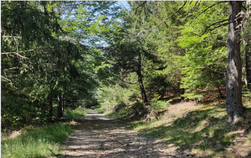
Dans la forêt de hêtres (Béatrice Galzin)