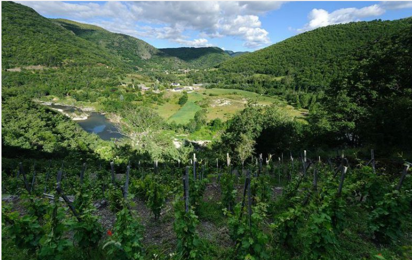
Vignes à Ispagnac (Arnaud Bouissou)