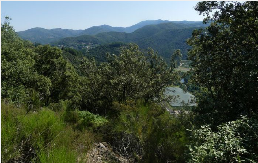
Vue sur la vallée de l'Hérault (Nathalie Thomas)