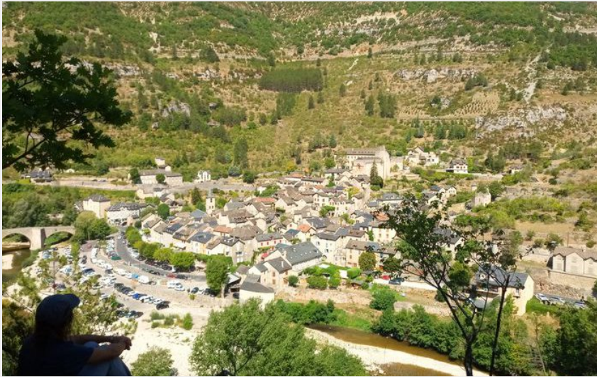
Vue sur Ste-Enimie