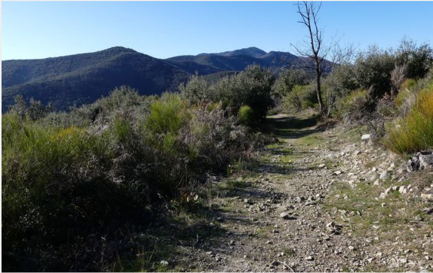
Vue sur le Liron