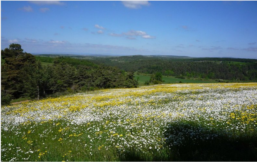
Les prairies avant la forêt (Michel Monnot)