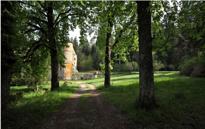
Château de Roquedols