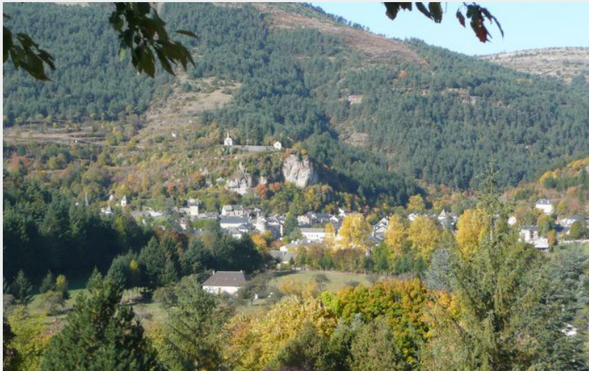
La cité de Meyrueis