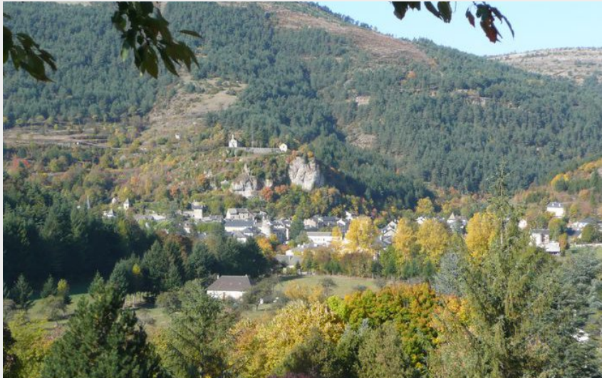
La cité de Meyrueis