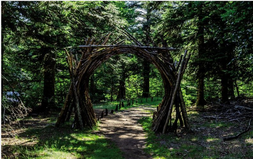
L'orée, porte d'entrée du parcours landart