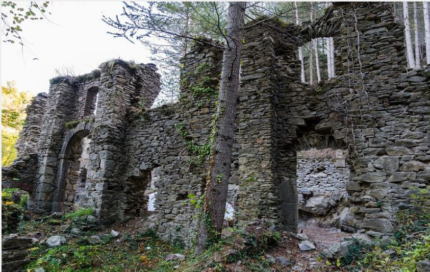
Usine du Bocard