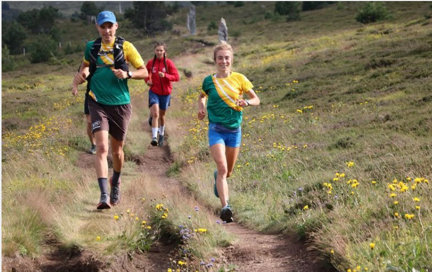
Traileurs au Mont-Lozère