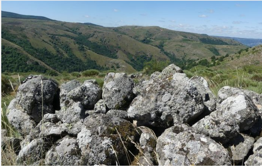
Vue sur la Cham de l'Hermet