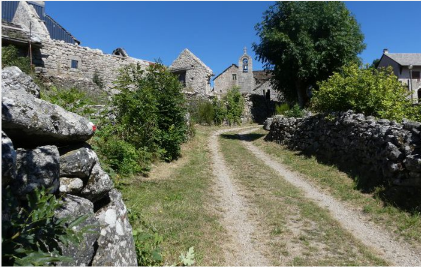
La Fage