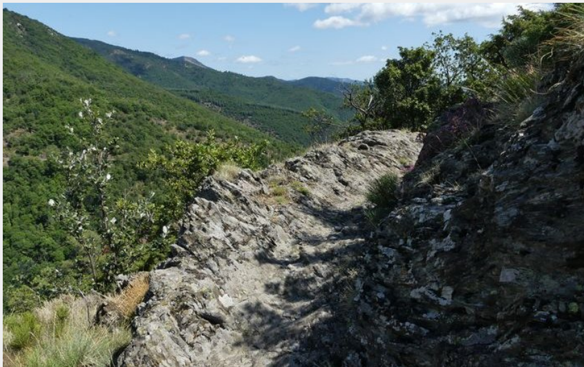
Descente dur Bréau