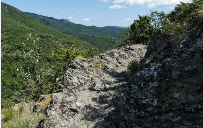
Descente dur Bréau