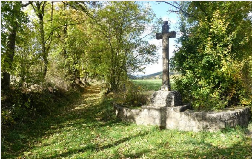
Croix autour de Chadenet