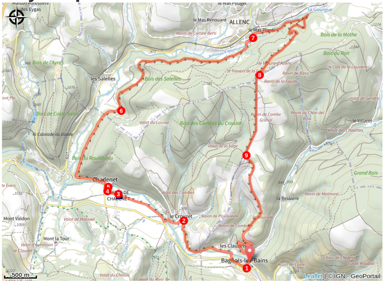
Saint-Privat's church (A)