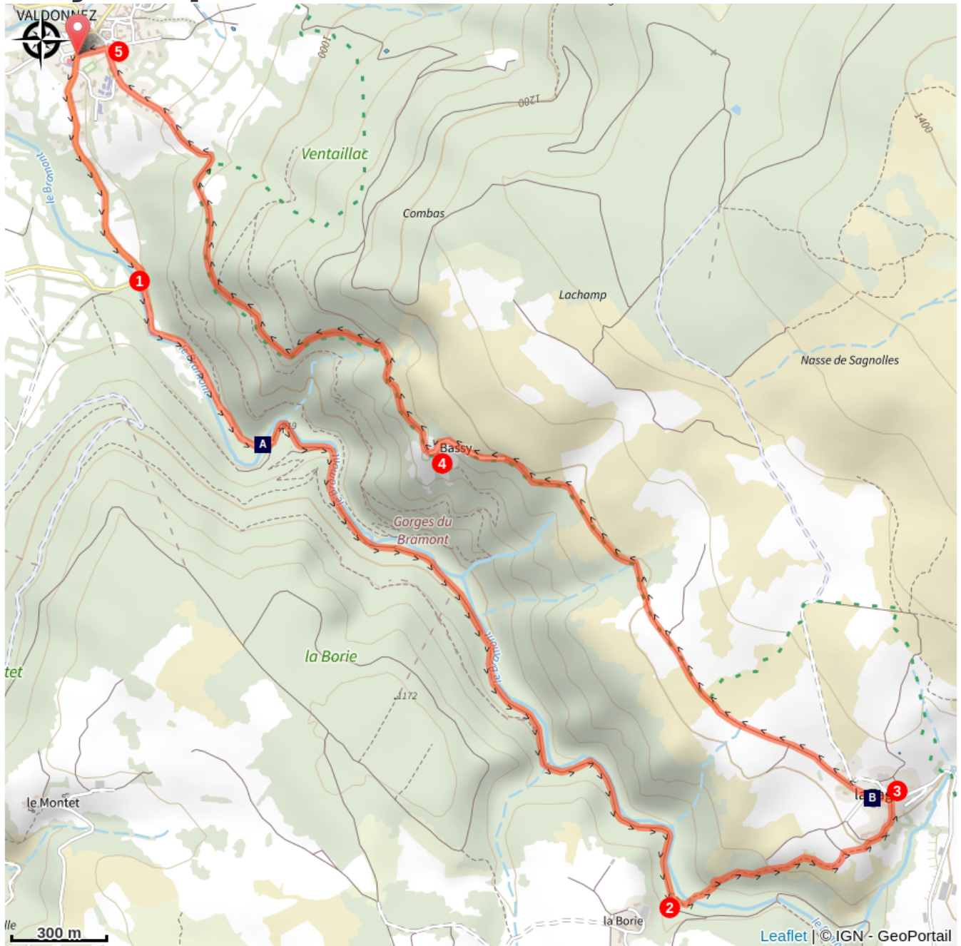
The Bramont river (A)