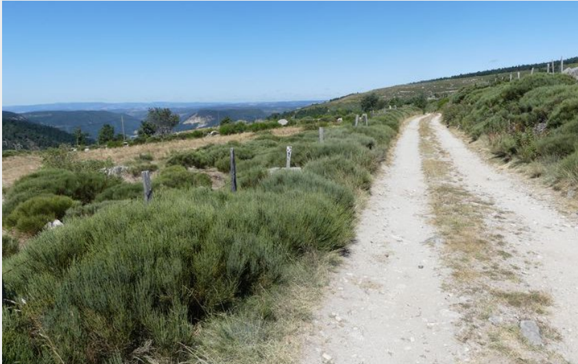
Paysage du mont Lozère