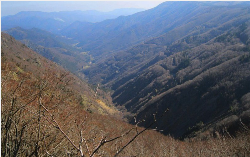
Le belvédère de la Serreyrède