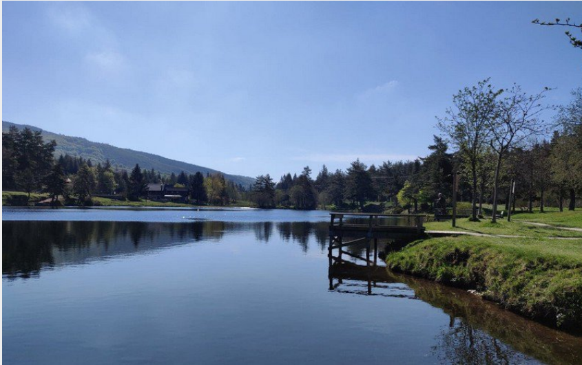
Le Lac du Bonheur (Béatrice Galzin)