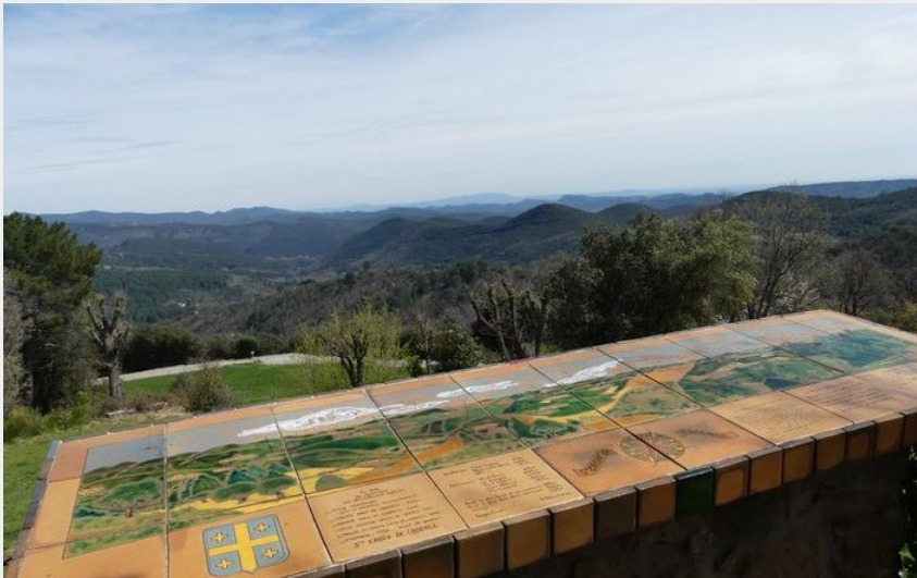
Sainte-Croix de Caderle (N Thomas)