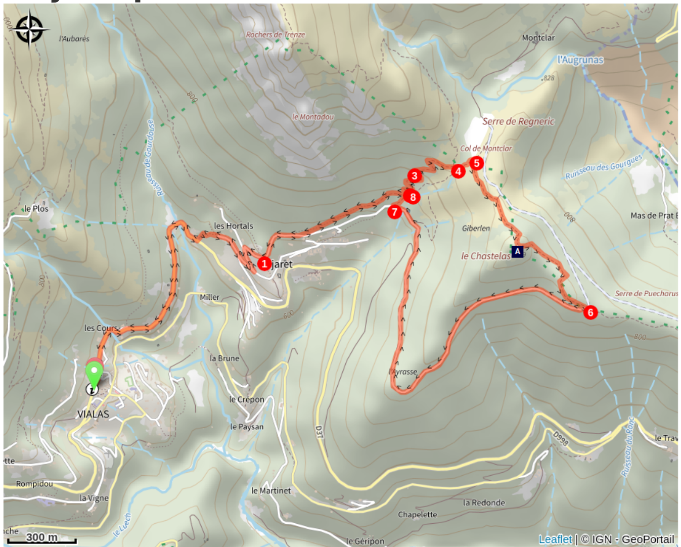
Chastelas de Montclar (A)