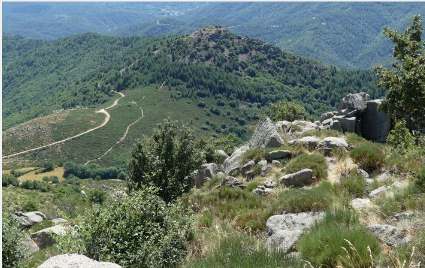
Vue sur le Chastelas (N Thomas)