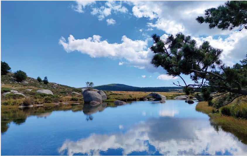
La plaine du Tarn (Adrien Majourel)