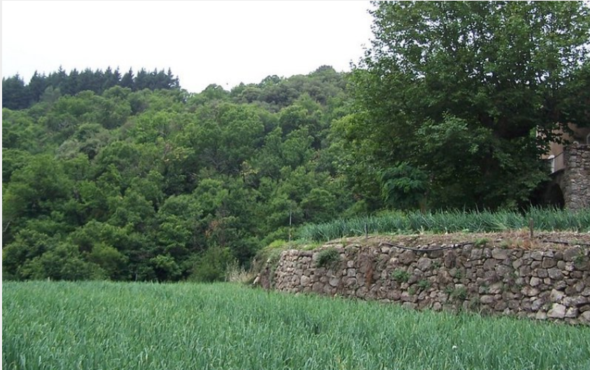
Culture Oignons Doux