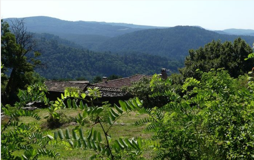
St Julien des Points