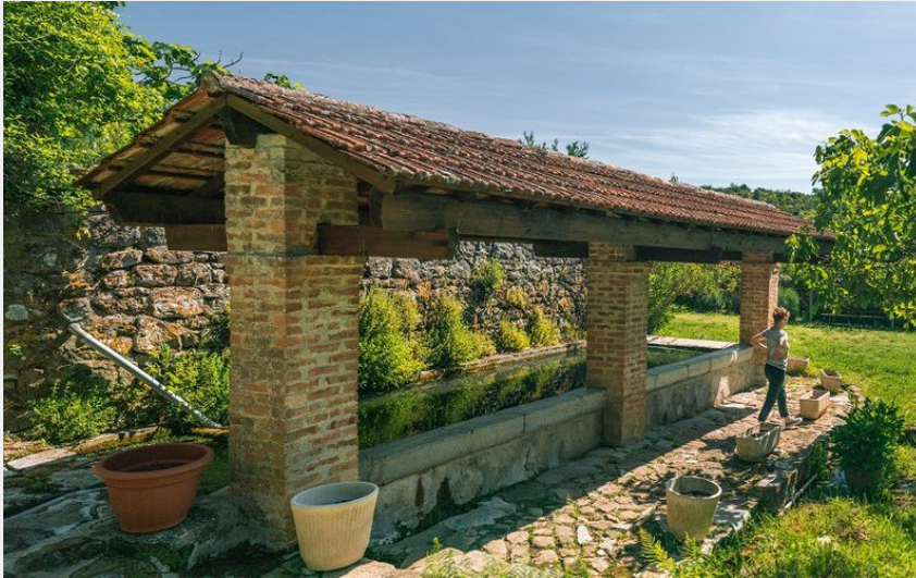
Lavoir, SAint Paul le Jeune