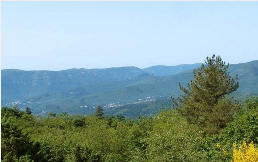
Vers le col des Mourèzes