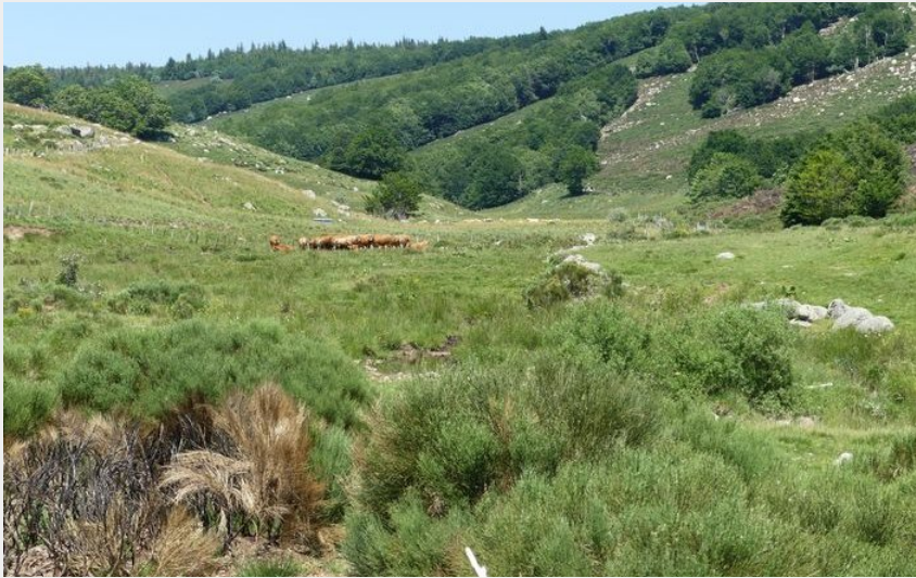
Troupeau au dessus de Gourdouze (nathalie.thomas)